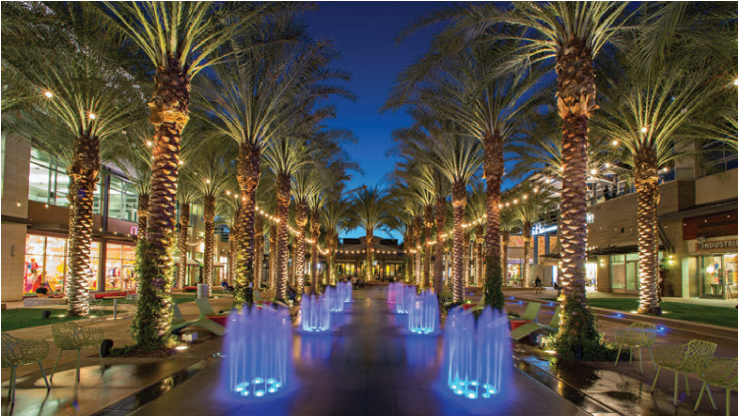
Scottsdale Quarter shopping center in Scottsdale, Arizona