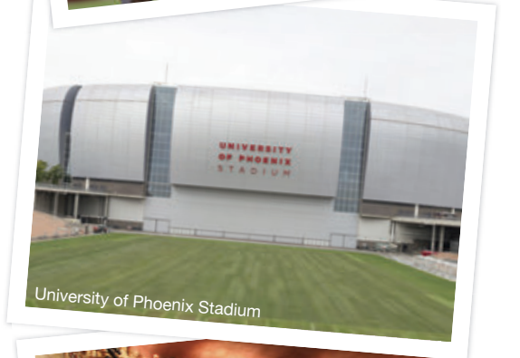
University of Phoenix Stadium